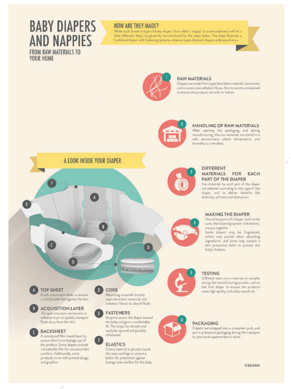
Figure 2 : Sectional diagram of a single-use baby diaper<sup>12</sup>

Some single-use baby diapers feature a wetness indicator that changes colour when exposed to urine. This indicator contains a pH-activated component. For more details, please see Annex A.1.