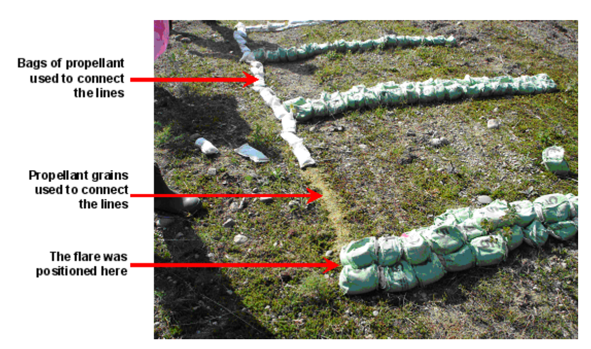
Figure 2: Excess Propellant bags for artillery ammunition.